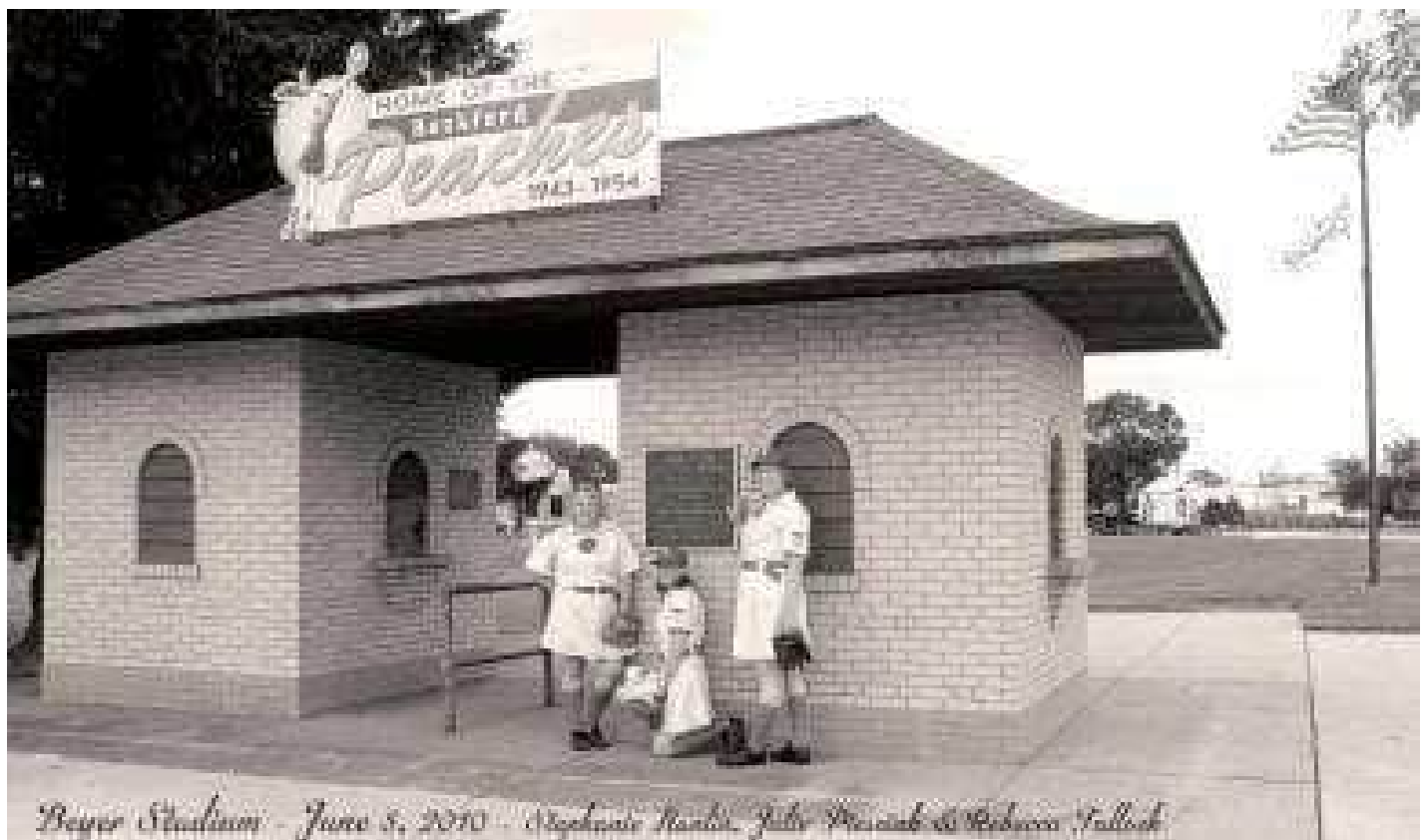
League Member in front of original Beyer Stadium Ticket Gate House at Rededication Ceremony in June 2010.

We play exactly how the original players played in 1943; with a 12" softball and underhand pitching, which is different than what was depicted in the film. We are mostly about teaching baseball women's history through playing ball and having a lot of fun doing it; experience playing baseball is not necessary, but always helpful. We are building the original 4 teams representing the Rockford Peaches, Kenosha Comets, Racine Belles, and South Bend Blue Sox; so if you live in Northern Indiana, North East Illinois, or South East Wisconsin and would like to play some 12" Softball with us, please send me an email with you interest. To learn more about our league and send us an email, visit our website at: www.ww2girlsbaseball.com .