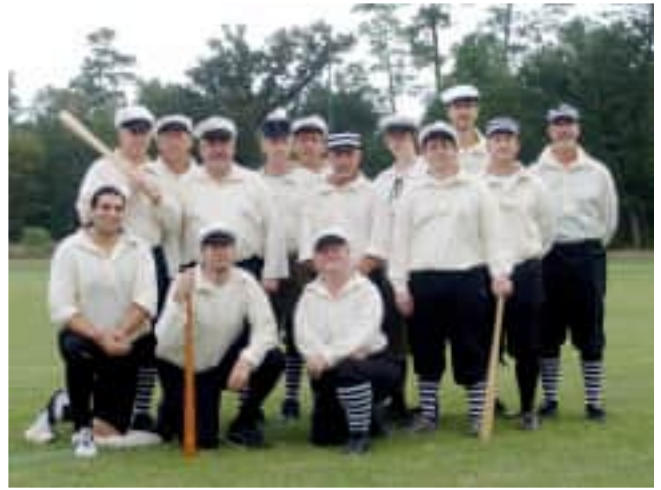
Montgomery College Saw Dogs