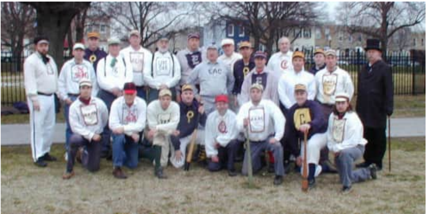
Delagates & All-Clubs Match Participants from the 2008 Convention in Baltimore, MD