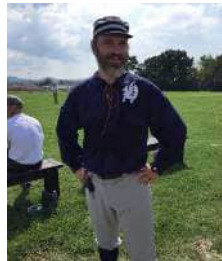
"Lancelot" of the Spinners

Another issue was how to handle all the requests of people who wanted to play. The requests numbers showed we'd have enough for a second team, and we tried that. That added some thorny times to the season and I can only blame myself for trying to go too far in order to keep people interested and grow the club. My recommendation is concentrate on the one team that first year. Ask those interested to keep coming out to watch games and make a contact roster for the following year. Then in your second season, if you still have enough interest try starting a second team. Our second team, the Spinners, ended up with 4-5 really committed players.