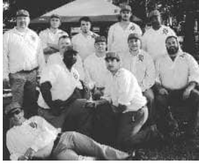
Winners of the 2016 Sam Davis Cup