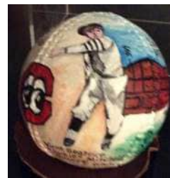
Hand painted Trophy Ball